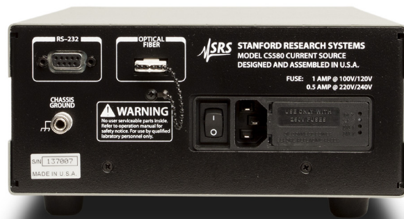
CS580 rear panel