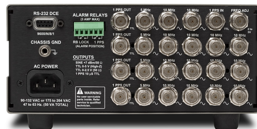
FS725 rear panel (with Opt. 03)