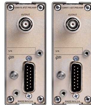
SIM910 & SIM911 rear panels