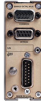
SIM925 rear panel