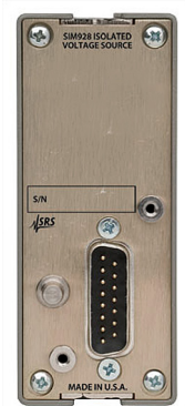
SIM928 rear panel