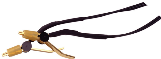
SR726 Kelvin Clips

The SR715 and SR720 support three types of binning schemes: pass/fail, overlapping and sequential. Pass/fail has only two bins: good parts and everything else. Overlapping (or nested) bins have one nominal value and are sorted into progressively larger bins (e.g., \pm 1\% , \pm 2\% , \pm 3\% ). Sequential