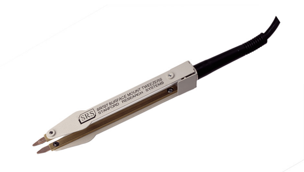
SR727 Surface Mount Tweezers

The SR715 and SR720 have a kelvin fixture which uses two wires to carry the test current and two independent wires to sense the voltage across the device under test. This prevents the voltage drop in the current carrying wires from affecting the voltage measurement. Radial components are simply inserted into the test fixture, one lead in each side. Axial devices require the use of the axial fixture adapters (provided). Surface-mount devices, or components with large or unusually shaped leads, can be measured with optional SMD Tweezers (SR727) or Kelvin Clips (SR726). The tweezers and clips attach directly to the LCR meter's front-panel test fixture. An optional BNC Fixture Adapter (SR728) allows you to connect a remote fixture or other equipment through one meter of coaxial cable.