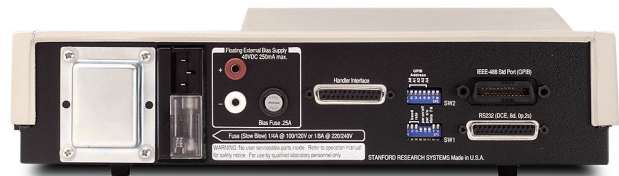
SR720 rear panel

Two rear-panel input connections are provided for an external bias voltage. Voltages as high as 40 VDC can be used. An optional handler interface provides control lines to a component handler for sorting. A standard RS-232 interface allows complete control of all instrument functions by a remote computer. A GPIB interface is included with the handler option.