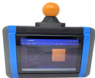
Orange Color Analysis

Compared to other handheld colorimeters, the StellarRAD+Color utilizes a research-grade spectrometer with <1nm spectral resolution, making these instruments the first choice in reliable testing, field demonstrations, installations, R&D, and quality control.