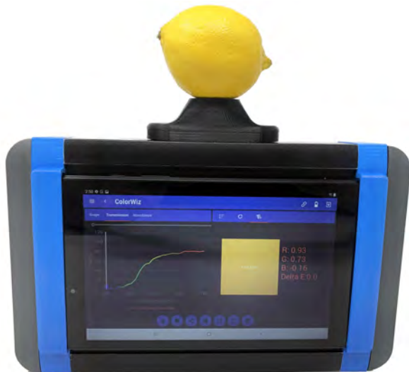
Lemon Color Analysis

The StellarRAD+Color is great for QC of incoming products. We manufacture many of our products with vibrantly colored anodized metal enclosures. Our light sources are a bright gold and all incoming parts are tested to meet our color standard. With this QC process, all of our light sources will always have the same golden color. We use the StellarRAD+Color to measure the perfect gold sample. Then we can record its CIE L*a*b* color values and load the saved sample as a reference. Each incoming sample is tested against the reference and a dE (color difference value) is calculated. A dE greater than 3 is considered a different color.