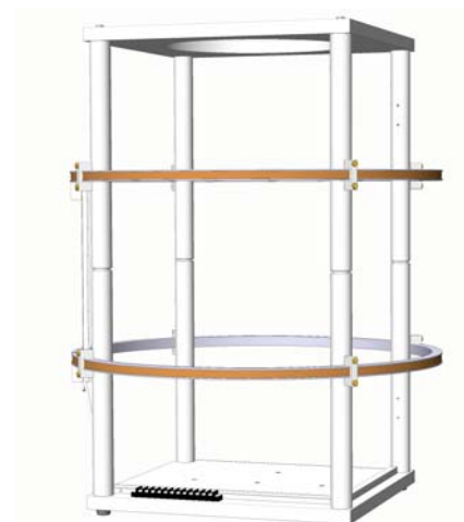
Fig. 5: BH600-1B-B / 1 axis: Z

- The coil specifications are in our Internet site: www.serviciencia.es -