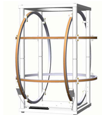
Fig. 3: BH600-2B-B / 2 axes: X, Z