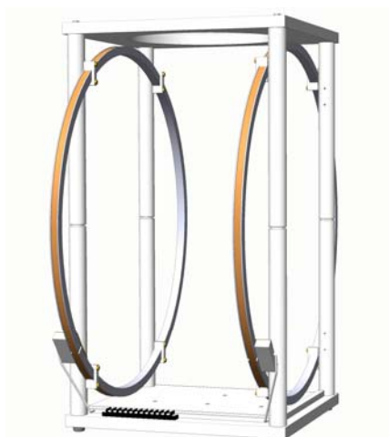
Fig. 4: BH600-1A-B / 1 axis: X